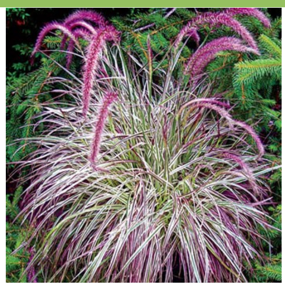
Pennisetum - Setaceum Cherry Sparkler Z 9-11/Ht 30-48

Waves of Graceful nodding, soft purple plumes arch up and out from burgundy-tinted foliage in true fountain grass form. Especially dramatic in groups, mass plantings, and as a single focal point.