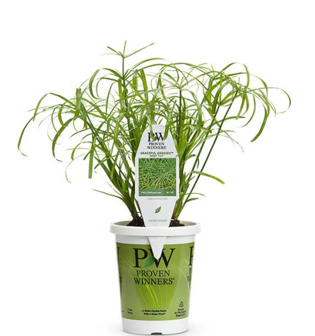
Cyperus Baby Tut - Z 9-10 / Ht 18-24"

Acorus is a grass like perennial with butter-yellow sword – like blades. It's a great addition to containers, the border, or the edge of a garden pool or pond, as it likes moist soil.