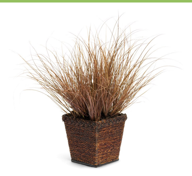
Carex Toffee Twist - Z 7-10 / Ht 18-24"

Iridescent, slender mahogany foliage drapes gracefully and is especially attractive as an accent plant.