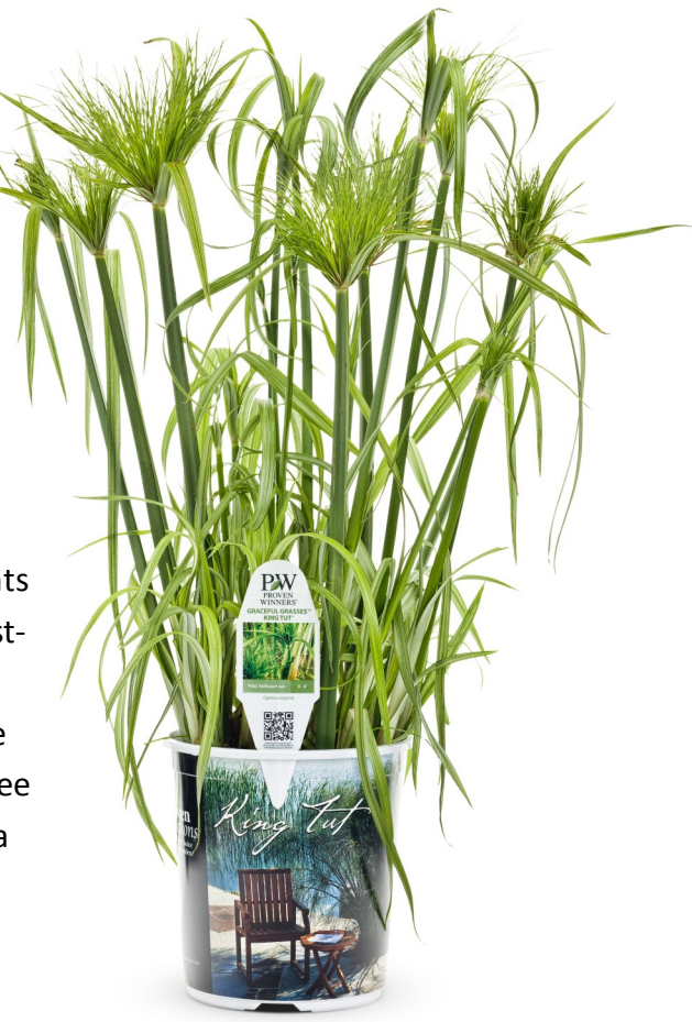
Cyperus King Tut - Z 9-10 / Ht 48-72"

Iridescent, slender mahogany foliage drapes gracefully and is especially attractive as an accent plant.