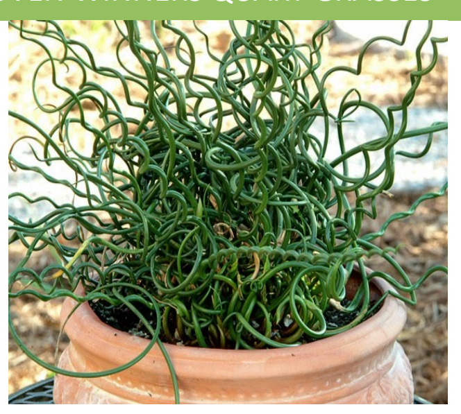
Juncus Curly Wurly

With rich burgundy foliage, this fast and easy warm season grass reaches 3-6' tall depending on the location and season. A bit too big for a 4.5", but impressive in all container sizes.