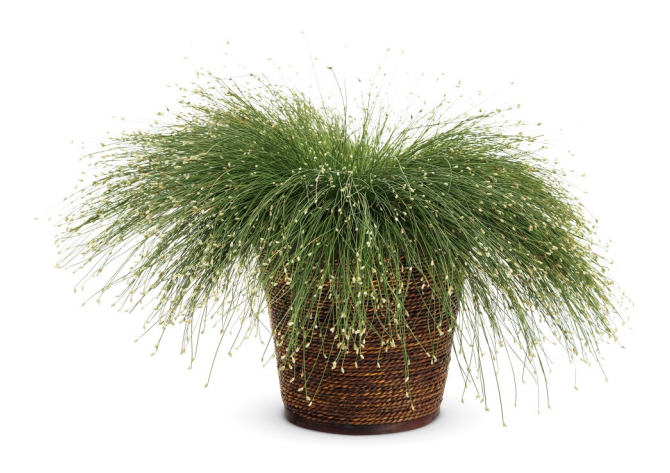
Scirpus Fiber Optic Grass

Unique, corkscrew, spiraling, leafless evergreen foliage adds shape and structure to combinations and borders. In the summer, tiny, greenish-brown flowers are produced in small heads.