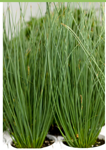
Juncus Blue Mohawk Z 5-9 / Ht 24-36"

A moderately vigorous rush with fantastic blue-green foliage that works perfectly as a texture plant in containers as well as in the landscape.