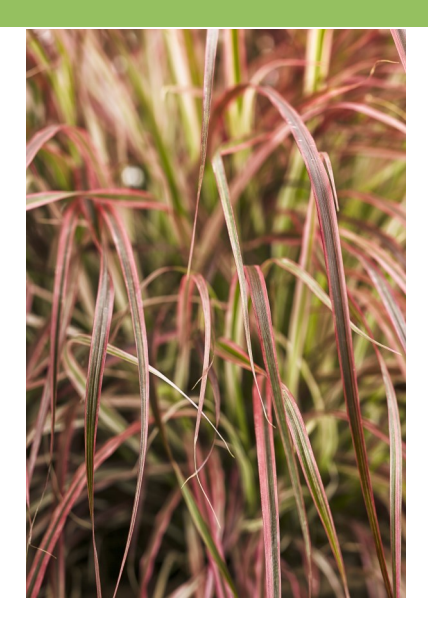
Pennisetum - Setaceum Fireworks Z 9-11/ Ht 24-30" Chosen for its color, texture and performance. 'Fireworks' is a pink and white variegated purple fountain grass with a strong upright, arching habit that prefers full sun and is sure to add strong fall inter-