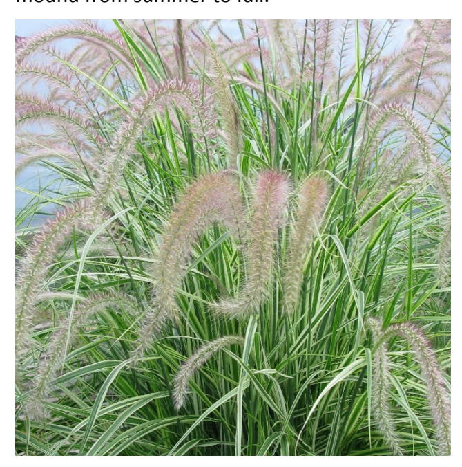
Pennisetum - Setaceum Sky Rocket Z 9-11/ Ht 30-48"

Pink Blush overtakes the white and green striped blades as light levels increase. Long red/burgundy plumes trail above the compact mound from summer to fall.