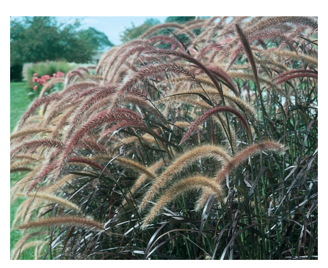
Pennisetum - Rubrum Purple Fountain Grass Z 9-10/ Ht 24-30

Waves of Graceful nodding, soft purple plumes arch up and out from burgundy-tinted foliage in true fountain grass form. Especially dramatic in groups, mass plantings, and as a single focal point.