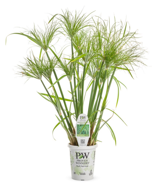
Cyperus: Grass like plants that must remain consistently wet. Though the crown should never be covered in water, all three varieties can thrive in a few inches of water.